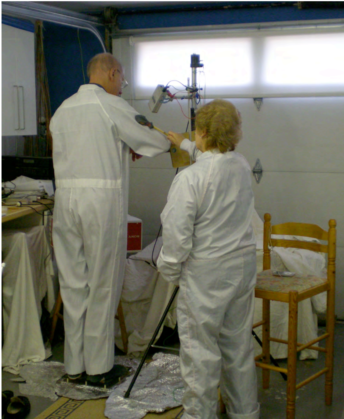
Figure 1: Set-up for testing inhabited garments. Test subject standing on charge measurement plate with arm supported on insulated support. Test operator ready to tribocharge area of sleeve directly in front of the fieldmeter.