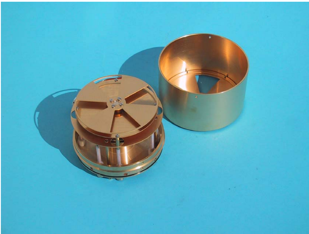
Figure 3: Internal features of JCI 131