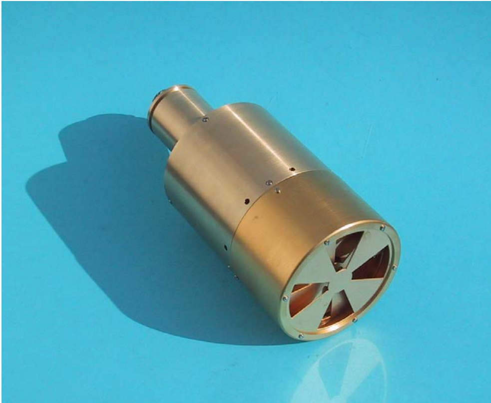
Figure 2: General view of JCI 131 Electrostatic Fieldmeter